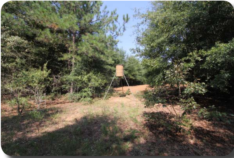
Open Areas with Deer Feeders