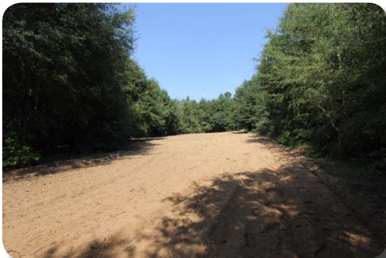
Small open areas for Hunting