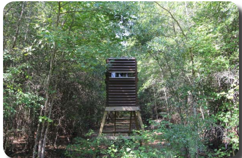
Deer stands Included