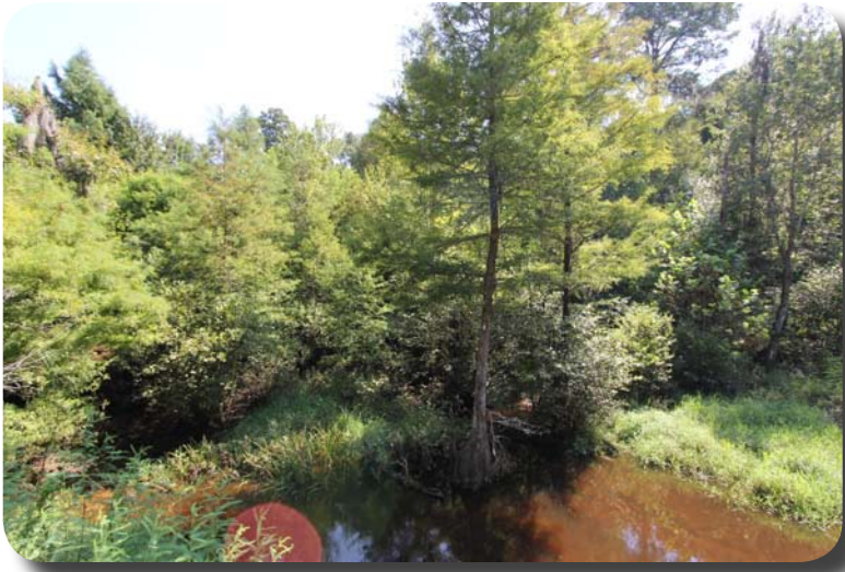
4 to 5 acres of Cypress Swamp