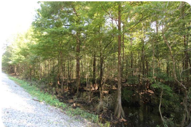
Creek flows year round