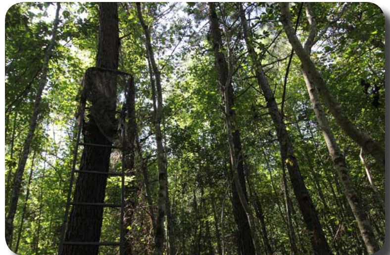
Deer Stands throughout the property are included