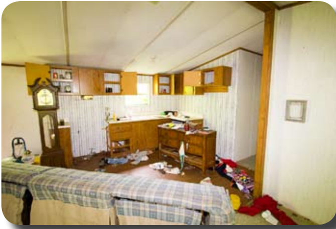
Kitchen area Appliances missing