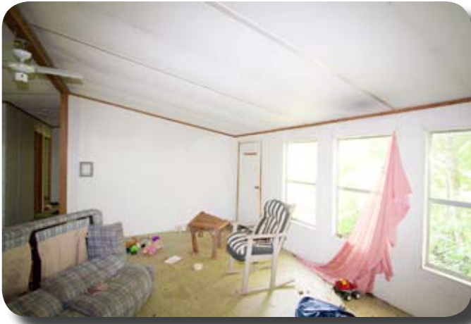
Living Room Needs floor covering and window treatments