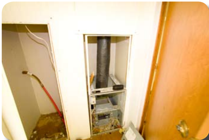
Needs new water heater and central heat and air