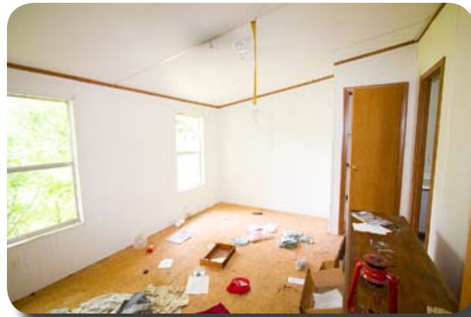
Master Bedroom Needs new floor covering