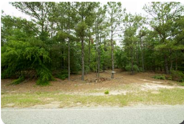
Frontage on Hadden Ranch Road