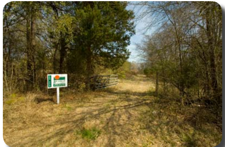
Gate Leading into the Property